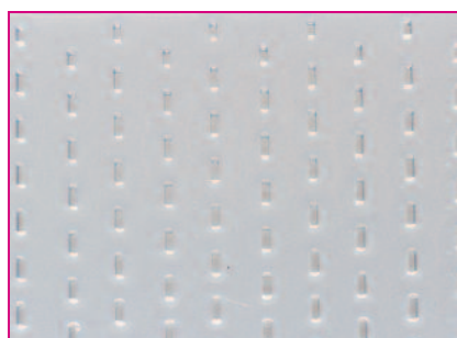
a cast gel