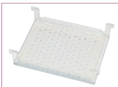
96 format UV tray with a cast gel

Comb blocks, available as standard and stretched options, are multichannel pipette compatible for speed loading