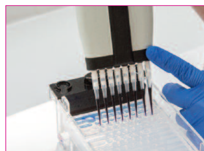
load using a multichannel pipette