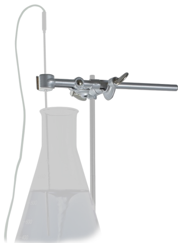
HTP-1 BS-010309-FK holder