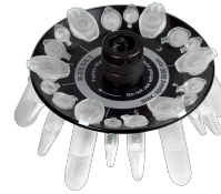
R-2/0.5/0.2 BS-010205-DK rotor

Rotor for 8 x 2/1.5 ml and 8 x 0.5 ml microtest tubes