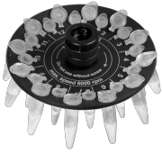
R-0.5/0.2 BS-010205-BK rotor

Rotor for 12 x 0.5 ml and 12 x 0.2 ml microtest tubes