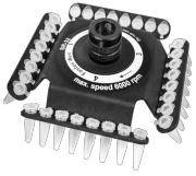
SR-32 BS-010205-FK rotor

Rotor for 2 x 8-section 0,2 ml microtube strips