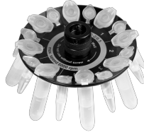
R-2/0.5 BS-010205-CK rotor

Rotor for 8 x 2/1.5 ml and 8 x 0.5 ml microtest tubes