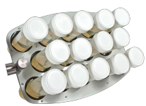
PRS-14 BS-010118-BK platform

14 tubes 20-30 mm diameter (50 ml tubes).