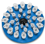
PV-32 BS-010207-CK platform